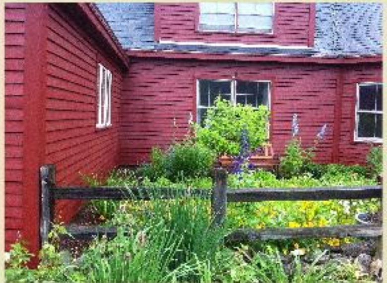
The Kitchen Garden