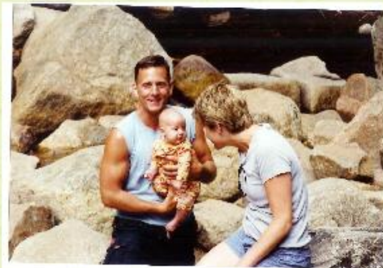
Joe is a natural with kids

especially those who are from backgrounds unlike our own.