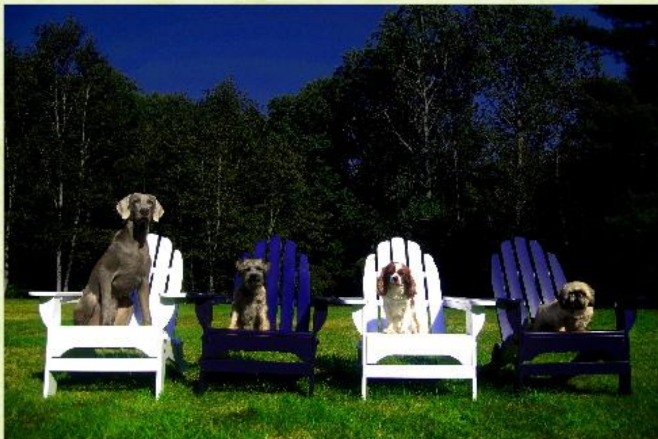
Abraham, Ebenezer, Ichabod, and Olivia

We also have three cats, Benjamin, Filomena and Juan. The pets are so sociable and they all LOVE kids!