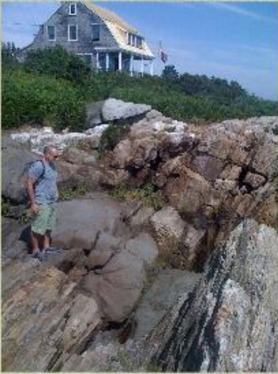
Coast of Maine