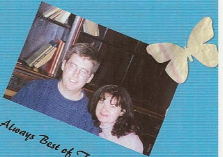
Always Best of Friends