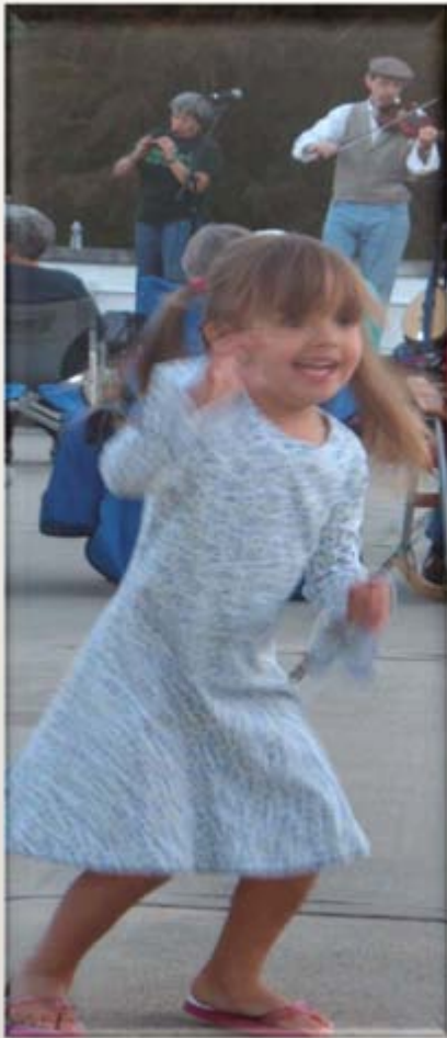
Celtic Music Concert