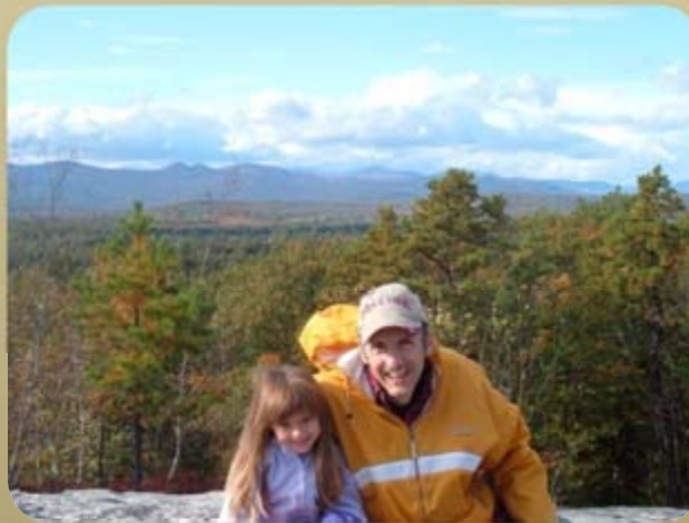
Hiking in Maine