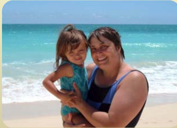
On the Beach