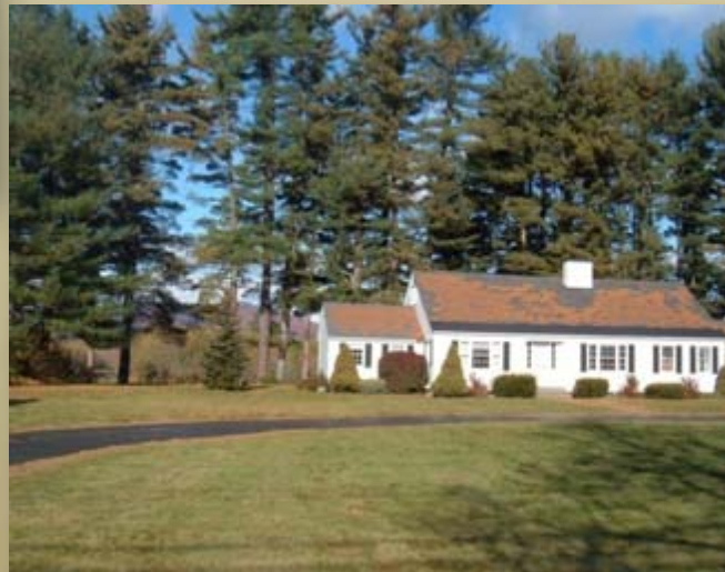
Nonnie & Granddad's New House in Maine 2009